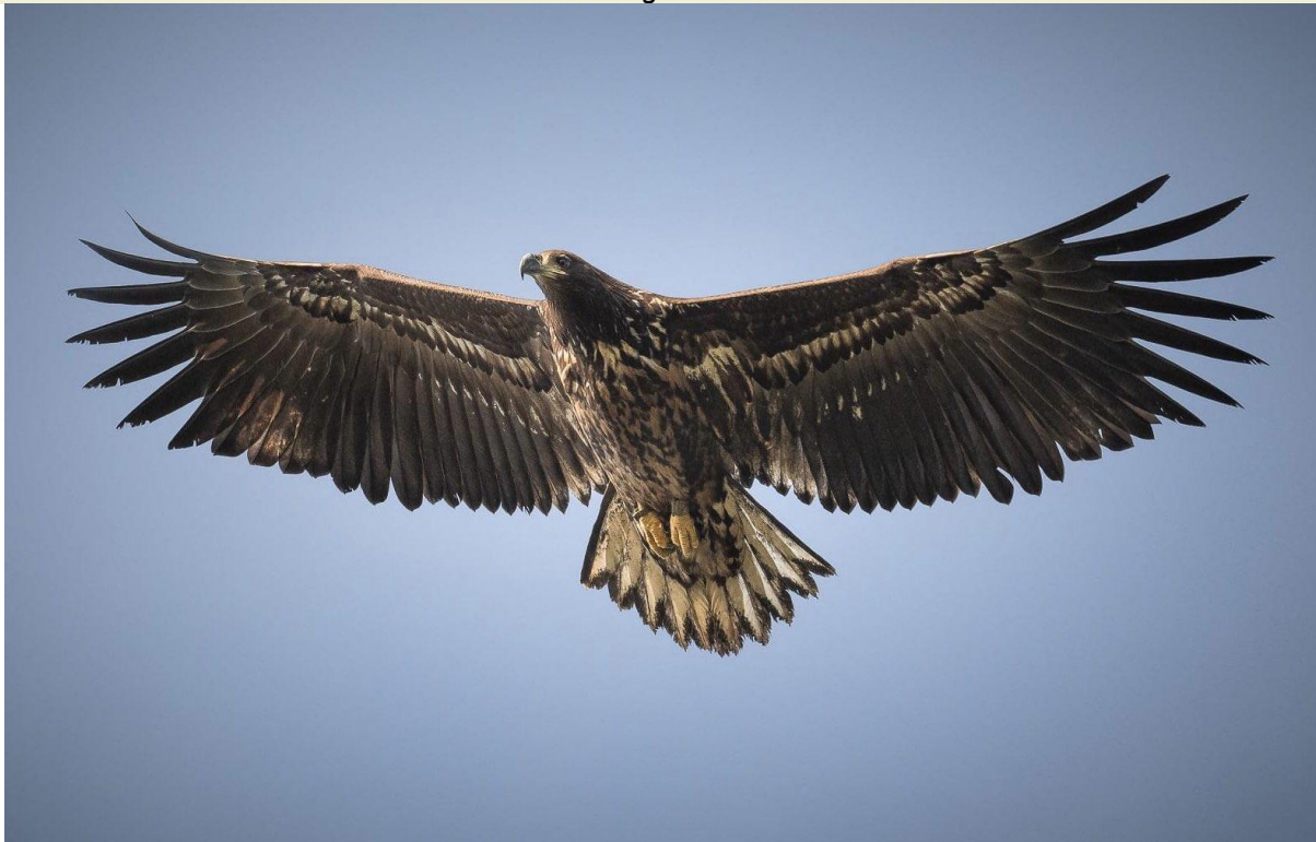
G461 in full glory